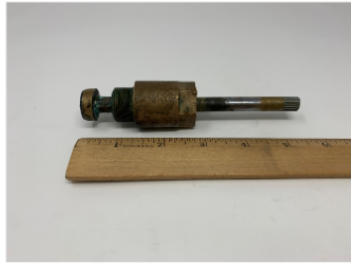
PART NEXT TO RULER