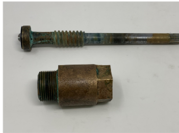
STEM REMOVED FROM BONNET